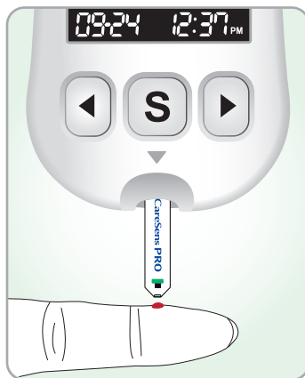
② Apply blood sample