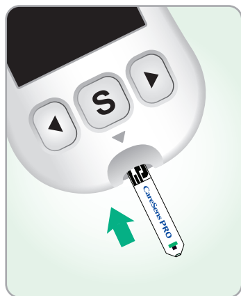
① Insert test strip